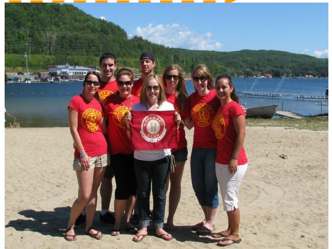
Members of the Rotaract Club on hand to officiate the event